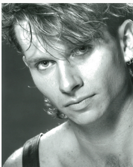
The artist circa 1988 or 89 Actor headshot

I am using the pre-order funds to pay for the publication costs, but production costs will certainly outstrip this offer!